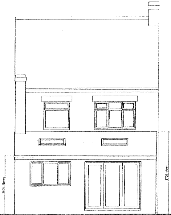
PROPOSED REAR ELEVATION 1:50