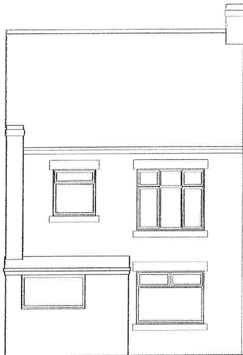
EXISTING REAR ELEVATION 1:50